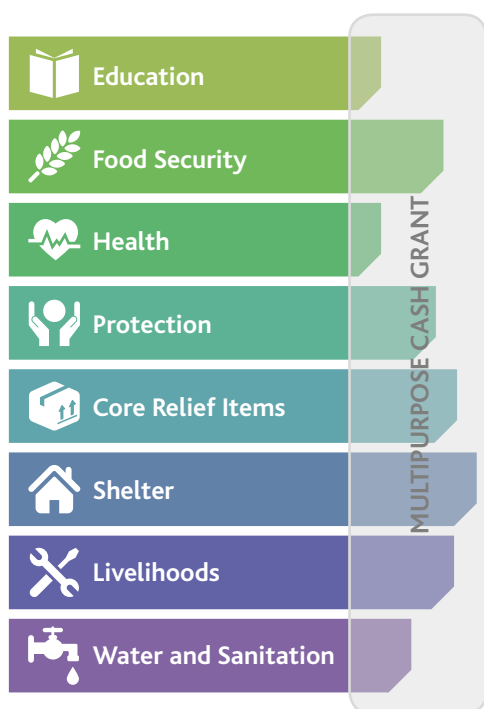
FIGURE 3. MEB and MPG as foundation for sector-specific interventions

The MEB should not be confused with the MPG transfer value. The MEB is fixed for a given emergency unless there are significant changes in prices or needs. In contrast, the MPG transfer value may change based on the availability (value and coverage) of other humanitarian assistance, such as government interventions, the targeting strategy and criteria (e.g. wider coverage with a reduced grant versus targeted coverage with a bigger grant), or the programme objective (e.g. livelihoods recovery) and any additional cash requirements households may have. See MPG Transfer Design for more detail.